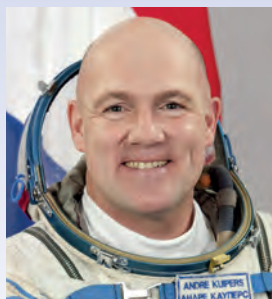
André Kuipers Astronaut